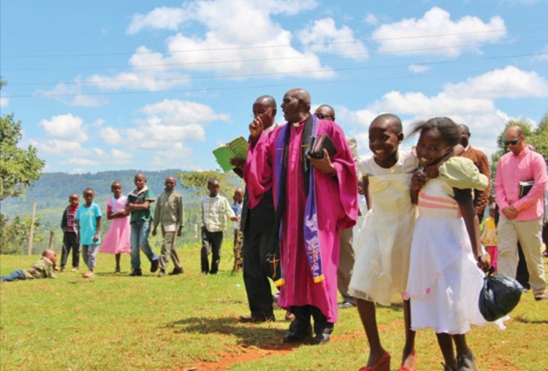
Dancing in celebration of God's blessings