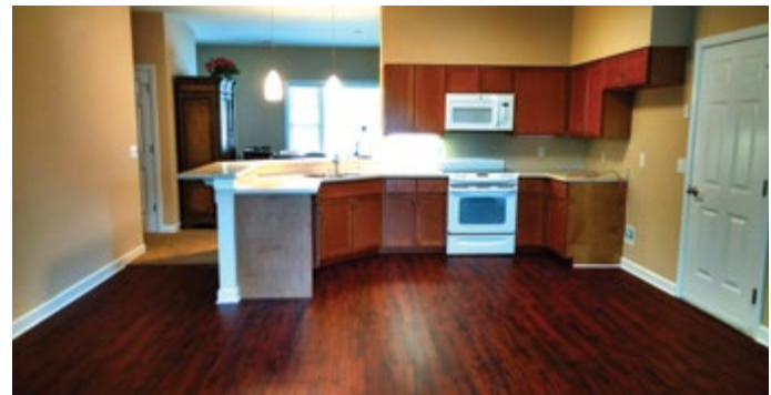
Shiny new floors and counter tops give these cottages quite the pick-me-up!