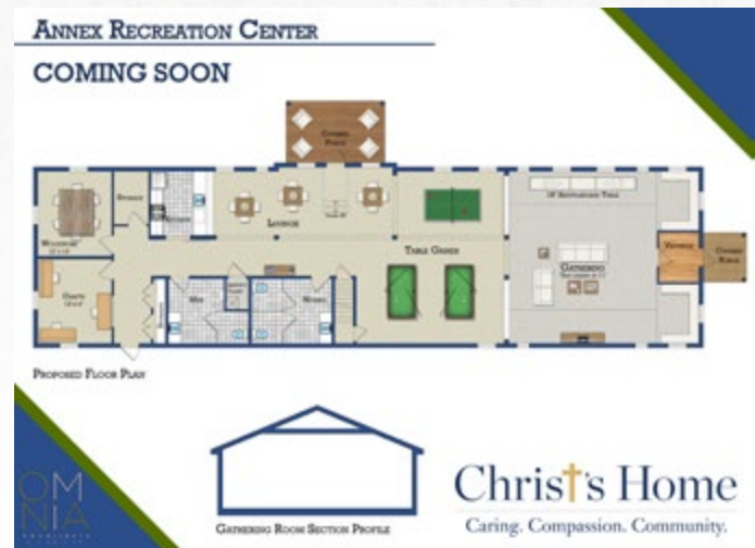
Manor Annex Building floor plan

and dining areas. Other options include newer laminate flooring, gas fireplace, energy-efficient LED lighting, various countertop and backsplash options, as well as crown molding. These options can be purchased by new residents before moving into a cottage, or by current residents desiring to upgrade their existing cottages. More detailed information, including floor plans of the new cottage layouts, will be available on our website this fall.