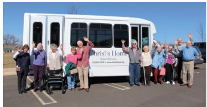
Residents ready to ride their brand new bus!