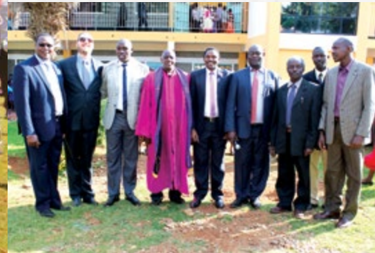
Some of the Mahiga Children's Home leaders