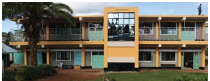
New boys' dormitory

If you are unable to join us for this trip, please keep the trip – and most of all the children of Mahiga – in your prayers.