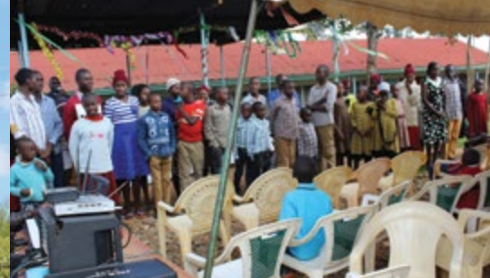
Celebrating the opening of the boys' dorm